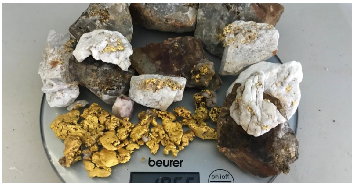
Photo 1: Nickol River Project, gold nuggets recovered and owned by Cyclone (refer to Table 1 in the ASX release 10 October 2022 for locations).

Mining International Pty Ltd, a wholly owned subsidiary of Cyclone Metals, holds tenure to 4 mining leases located 40 km southeast of Mt Isa in Queensland ( Wee MacGregor Project ).