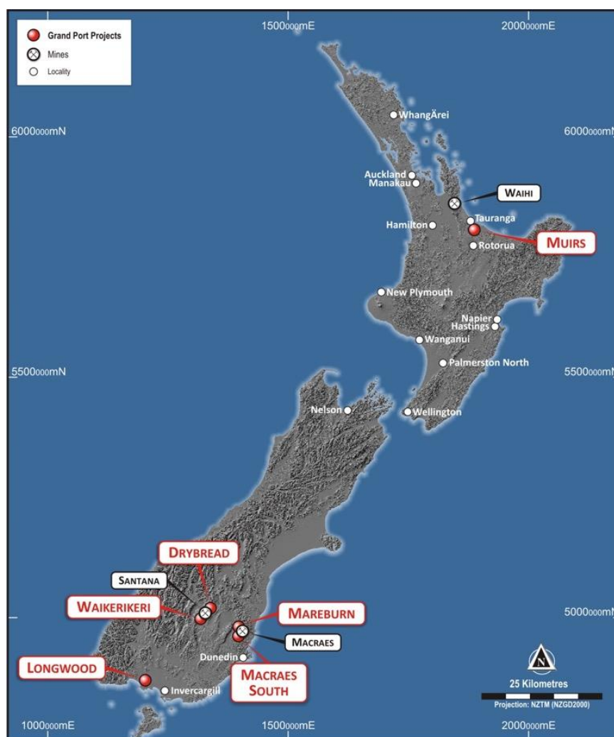
Figure 1: Location of Grand Port Projects